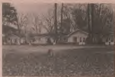
Motel on Premises